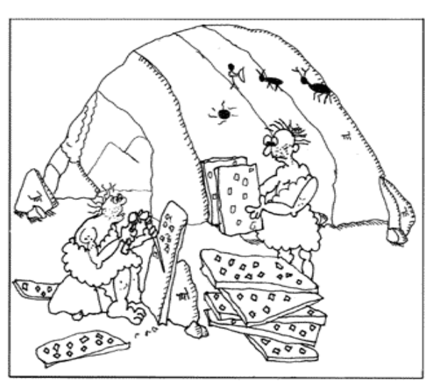
"Don't tell me. More last minute editorial changes."

* Director, Jenolan Caves Reserve Trust.